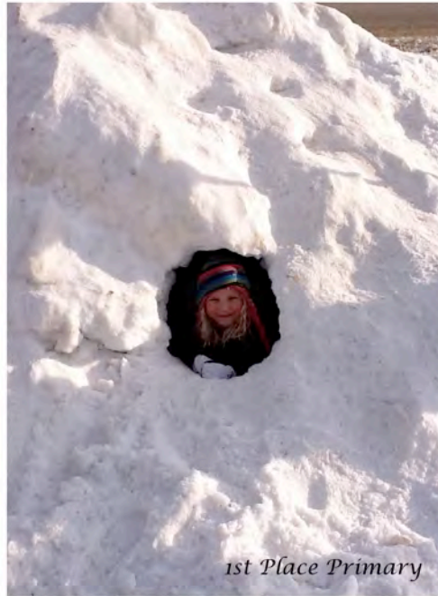
1st Place Primary