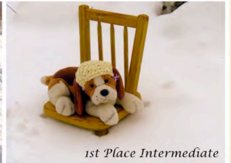
1st Place Intermediate