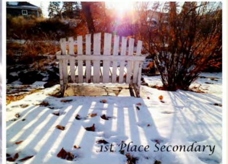
1st Place Secondary

Each winner (1st, 2nd, 3rd) will receive an EBUS t-shirt for their efforts. To see all our entries please visit our Facebook Album (no account necessary).